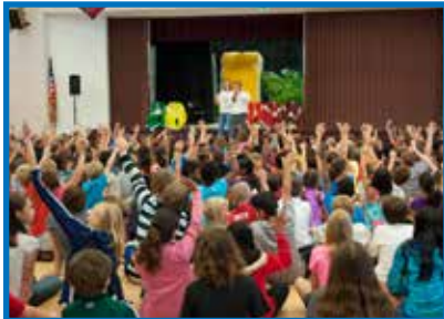
Eager students learn about the importance of air quality at a Flag Kick-Off Assembly