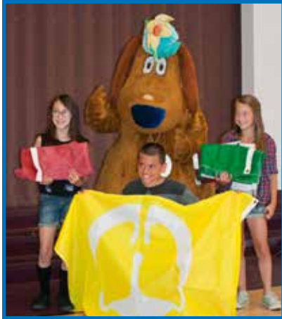
Students pose with Scooter at an Elementary School Air Quality Flag Kick-Off Assembly