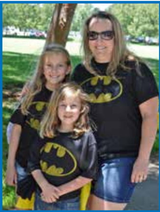
Superhero sightings at the Breathe Fun Ride in May 2013