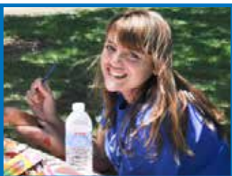
YAB Member works the face painting booth at the Breathe Fun Ride