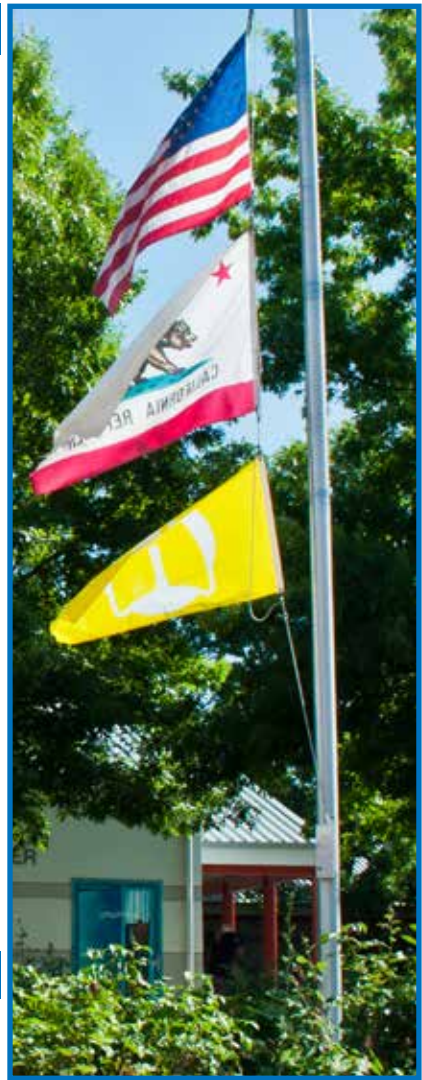
Natoma Station Elementary flies a yellow flag to indicate the day's air quality.