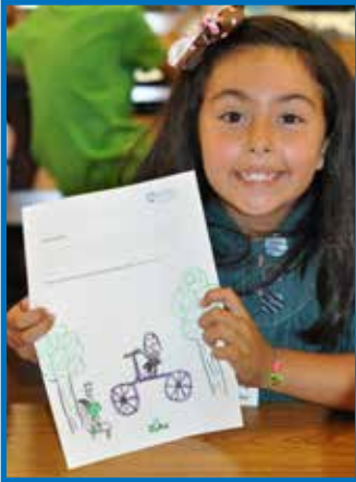
Student illustrates what she learned in the O24u afterschool program