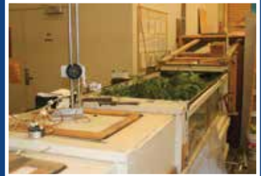
Custom-engineered lab equipment used to in pollution mitigation study.