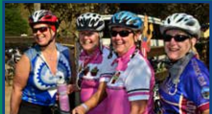
Trekkers enjoying a well-deserved rest stop.