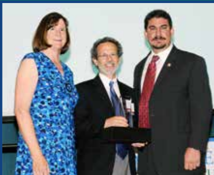
Rep. from UC Davis West Village accepts a 2012 Clean Air Award for Innovative Strategy

County of Sacramento Yocha Dehe Wintun Nation