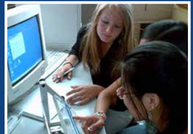
Students discuss research findings during A.I.R. Project study.