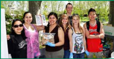
Student volunteers display a bag of cigarette butts collected from their campus for B.O.B.