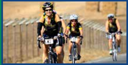
Trekkers enjoying some time on the road.