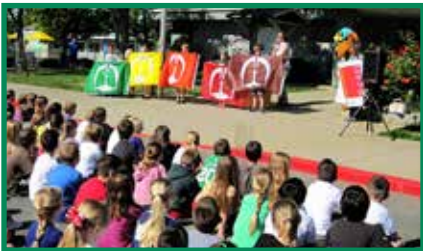
Local children learn about the Air Quality Flag Program during Clean Air Month.