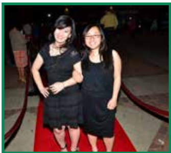
TUTD Reviewers strike a pose at the 2012 Hackademy Awards.