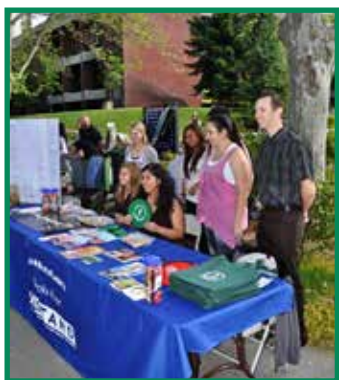
Student volunteers take a STAND at campus health fairs.