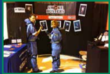
The SmokeBusters make an appearance at the Rental Housing Association Expo