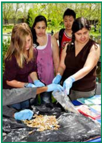
Students count cigarette butts collected for Billions of Butts