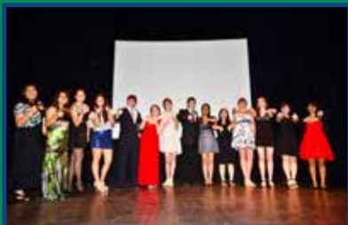
Thumbs Up! Thumbs Down! volunteers take the stage at the 2012 Hackademy Awards..