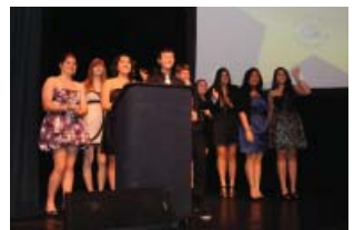
TUTD Members presenting the 2011 Hackademy Awards