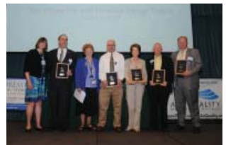
Clean Air Champions being recognized at the 2011 Clean Air Awards Luncheon