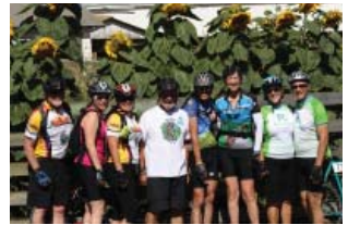
Trekkers at the 2010 Emigrant Trails Bike Trek in Petaluma, CA